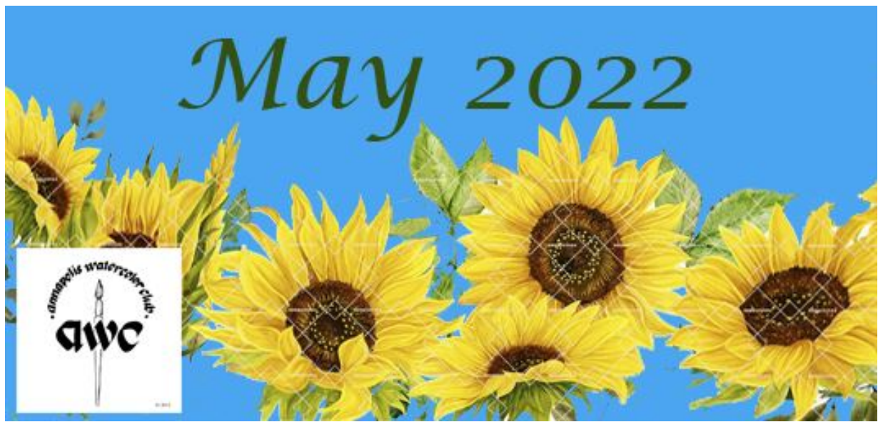
Sunflowers and blue sky are in support of the Ukrainian people