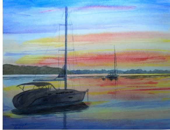
Sunrise At Drum Point