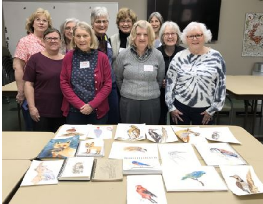
Our artists attending the sketch and painting event at the Robinson Nature Center.