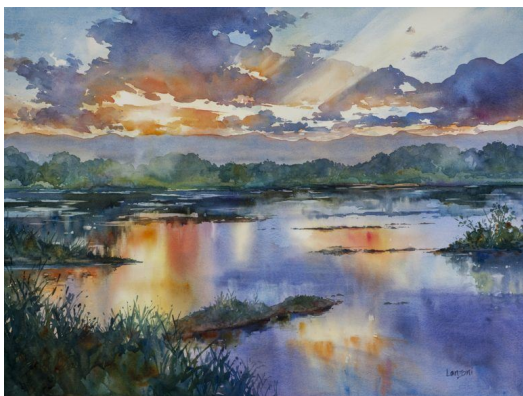
"Radiance" - 22 x 30