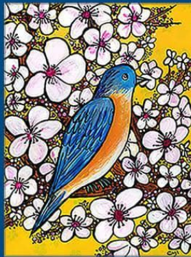
Claudine Intner "Bluebird With Cherry Blossoms" Acrylic